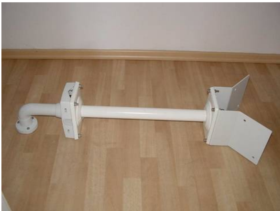
very special construction with a custom made corner mount and a total length from 1,20m