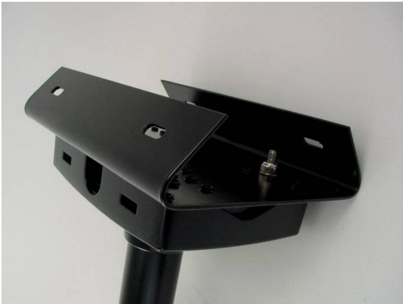
pole adaptor for 100-200mm poles, other diameter on request