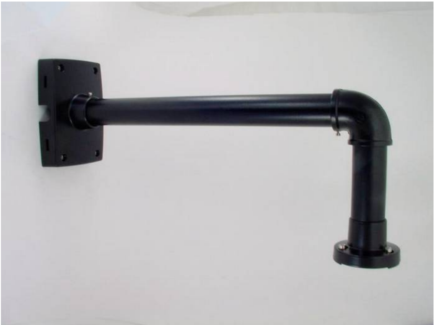
special wallmount with a lenght from 70 cm

We can make your custom mounting fast and to a very good price.