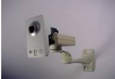
Wallmount with integrated PoE splitter for AXIS M1011

At last here are some special accessorie solutions for different AXIS camera modells