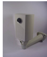
outdoorhousing with covered cable channel