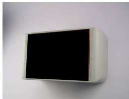
Infraredset with build in IR-LED camera covered behind a for human eye invisible black filterplate. works in 0-Lux up to 8m