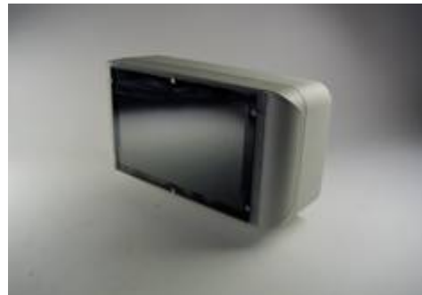
Infraredkit, outdoorversion IP 65