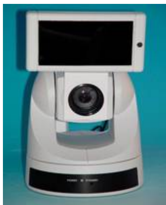
Add on infrared illuminator for AXIS 214 with build in microfon