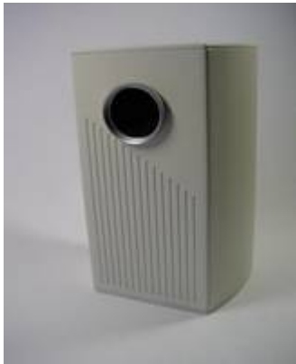
outdoorhousing with build in heater, fan and power supply. Works form 90-230VAC

With the new AXIS M1011 series we also updated our outdoorhousing series. Beside a new design the housing also gets new features like UV cutfilter frontglas for better outdoor colour quality, build in power supply and easy mounting plate from the backside.