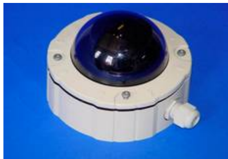
rugged outdoorhousing IP 67 for AXIS 212 and 216. Available also with build in heater and fan.