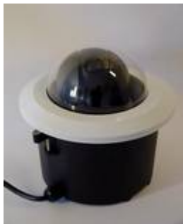
heated and waterproof housing for false ceiling mount. (outdoor) Mountings for AXIS 215/232/233 are available.