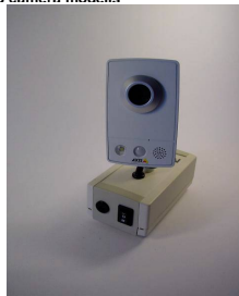
Accupacks in 5VDC and 12VDC version. The kit comes with a camera mounting. The basic modell have a 8 h runtime. Versions with longer runtimes are available.