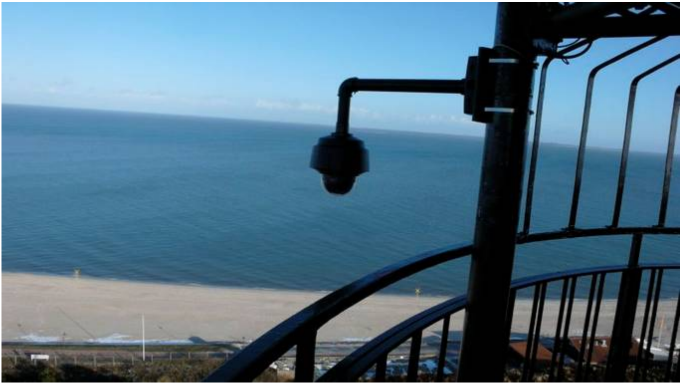
the new camera mounted to the antenna pole. Here you can see the new length of the wallmount.