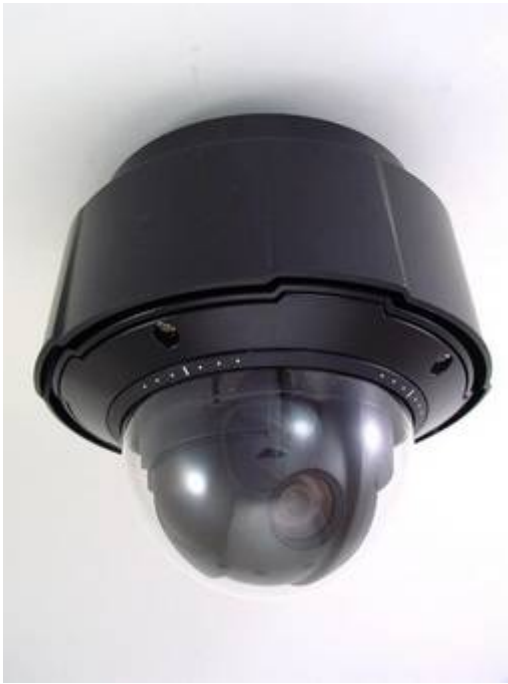
the 6032 in new color