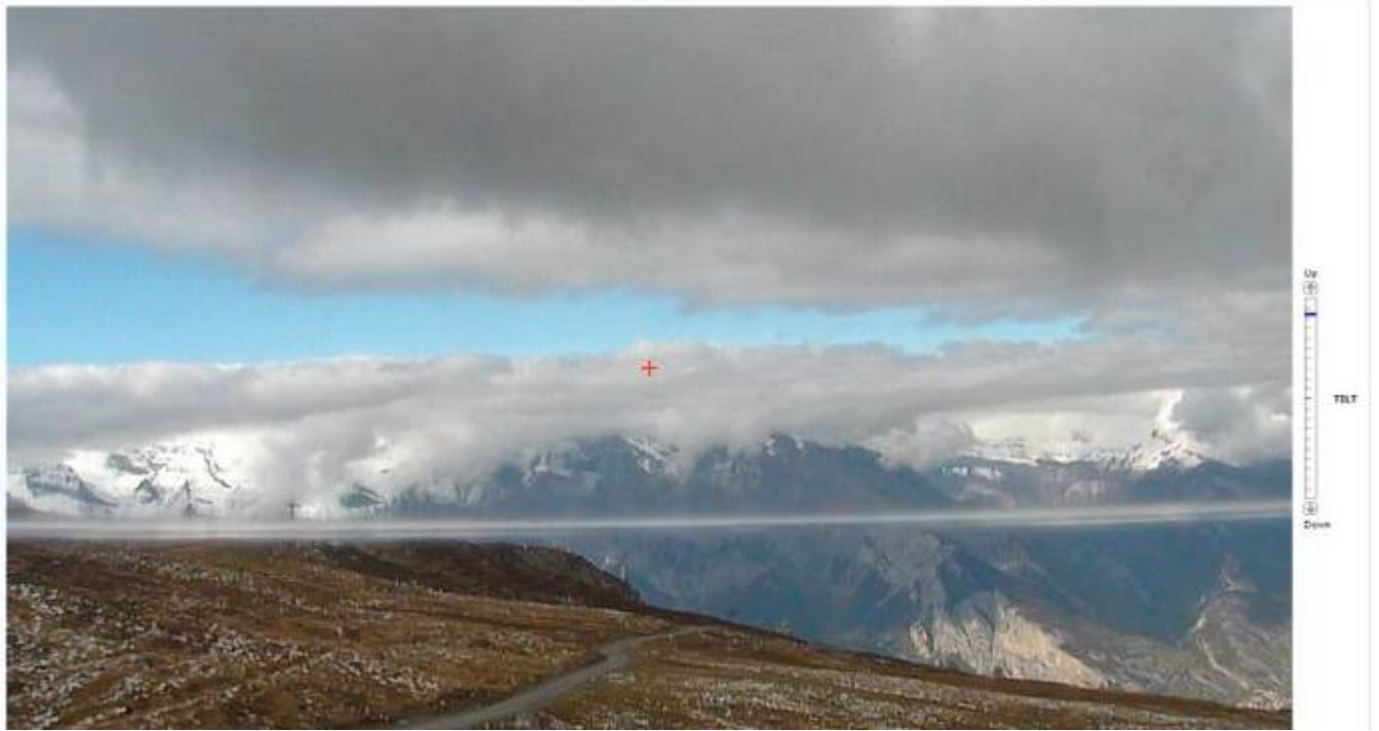
Above livepictures from original cameraglas AXIS Q6034