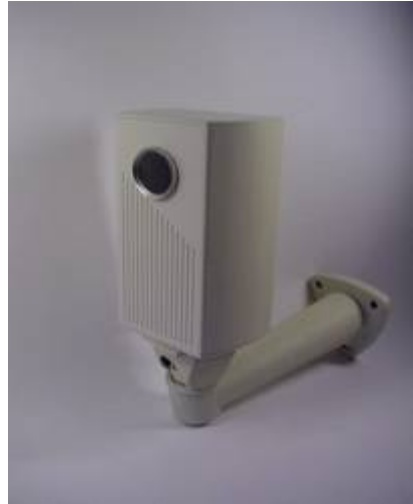
Modell 6207 massive wallmount with balljoint mounted directly to the housing with covered cable channel