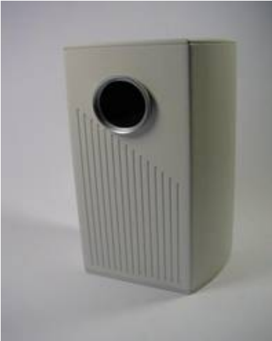
Modell 6206 Also you can use the wireless option from this modell because the housing is plastic.

Introducing the new protection housing with a lot of new features.. One of them are the frontglas. In this housing we build in a thin and smart looking glas with a aluminium ring. The glas is optical clear and got an UV-block coating. This brings a better colour quality. Also the diameter is bigger so you can use wide angle lenses. Camera mounted from the backside IP 65 Possibel is also now to mount a heater fan kit into this modell also.