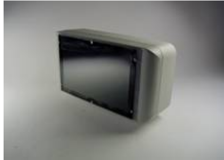
Modell 6204 /Waterproof

OPTIONS 6204: waterproof version built in PoE splitter accupack